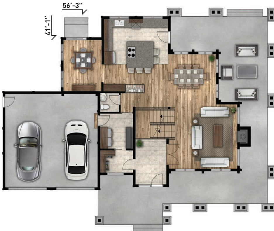
SECOND FLOOR 1030 sq. ft. / 95.70 m 2